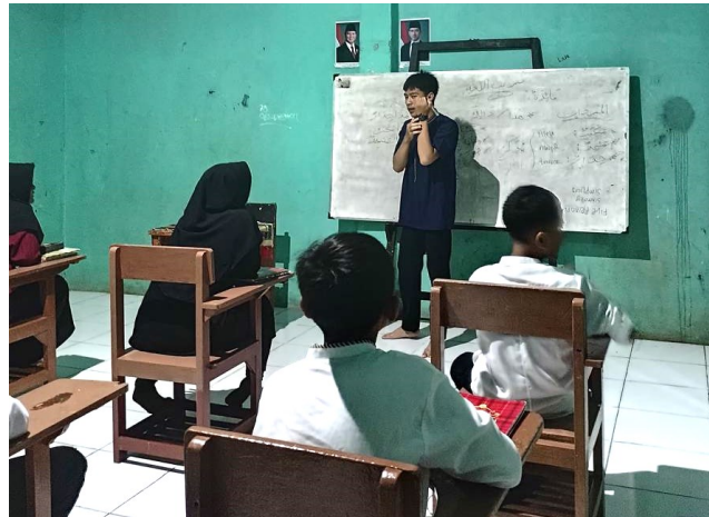
Figure 1. Arabic Language Learning Atmosphere of Shohibul Muslimin Islamic Boarding School

modern Islamic boarding school of Shohibul Muslimin is the competence of the teaching staff who are mostly graduates of Islamic boarding school who have a strong background in Arabic language teaching. The teachers of the Arabic language course are chosen in terms of their ability in Arabic and can teach well and fun so that the students are not bored in learning Arabic. When the students are bored in the lesson, they will be disliked for the Arabic language material. Therefore, Arabic language material is given to teachers who are competent in their fields to achieve the expected goals and objectives.